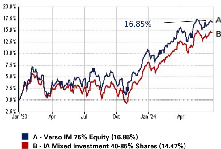
Cumulative return since inception (1/01/23-30/06/24)